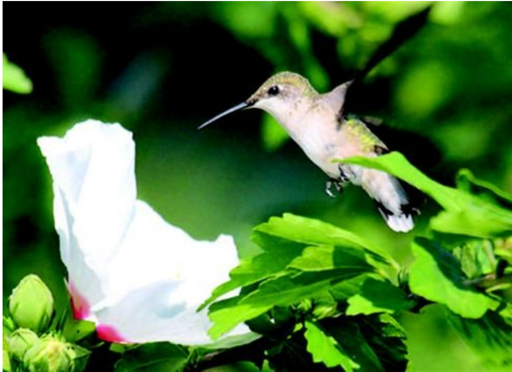
Kelly Hunt/Photos by MK

Hummingbirds are very special for many reasons. For one, they are very, very small. The smallest kind of hummingbird weighs less than 2 grams. That's less than half the weight of a sheet of paper!